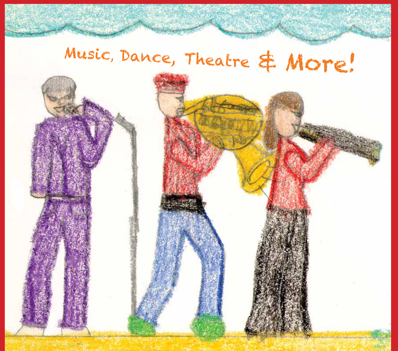
Artist: Joseph Oh, PS 32Q

Arts Education for Young People 2011-2012 Season